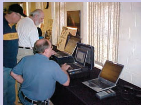
Dreisilker Electric Motors, Inc. Glen Ellyn, Illinois

Basic Electricity and Electromagnetism Review of motor testing technologies Commissioning New and Repaired Condition-Based Testing Trending Troubleshooting Motor Circuit Analysis Electrical Signature Analysis Time to Failure Estimation™