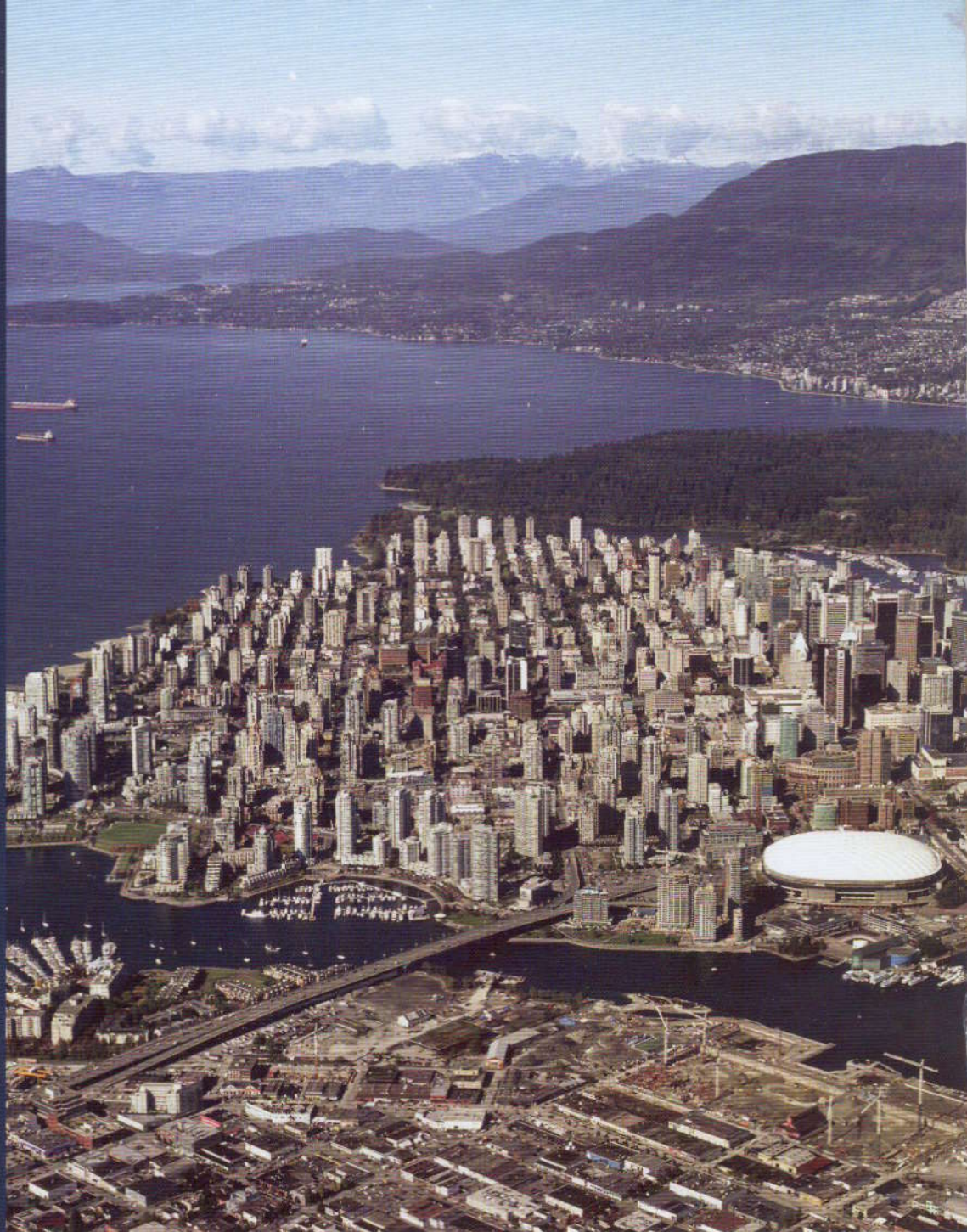
Aerial view of Vancouver, site of 2008 ISEI.

A Publication of the Dielectrics & Electrical Insulation Society